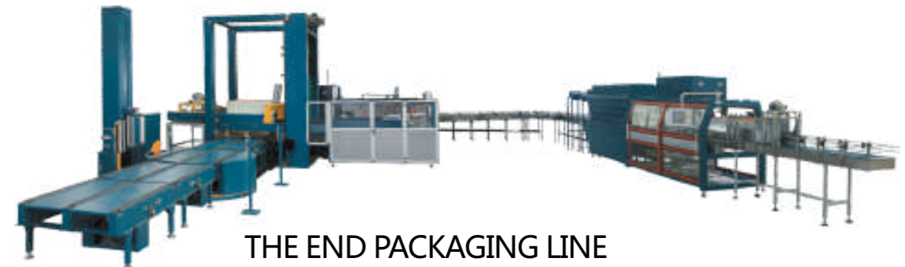
THE END PACKAGING LINE